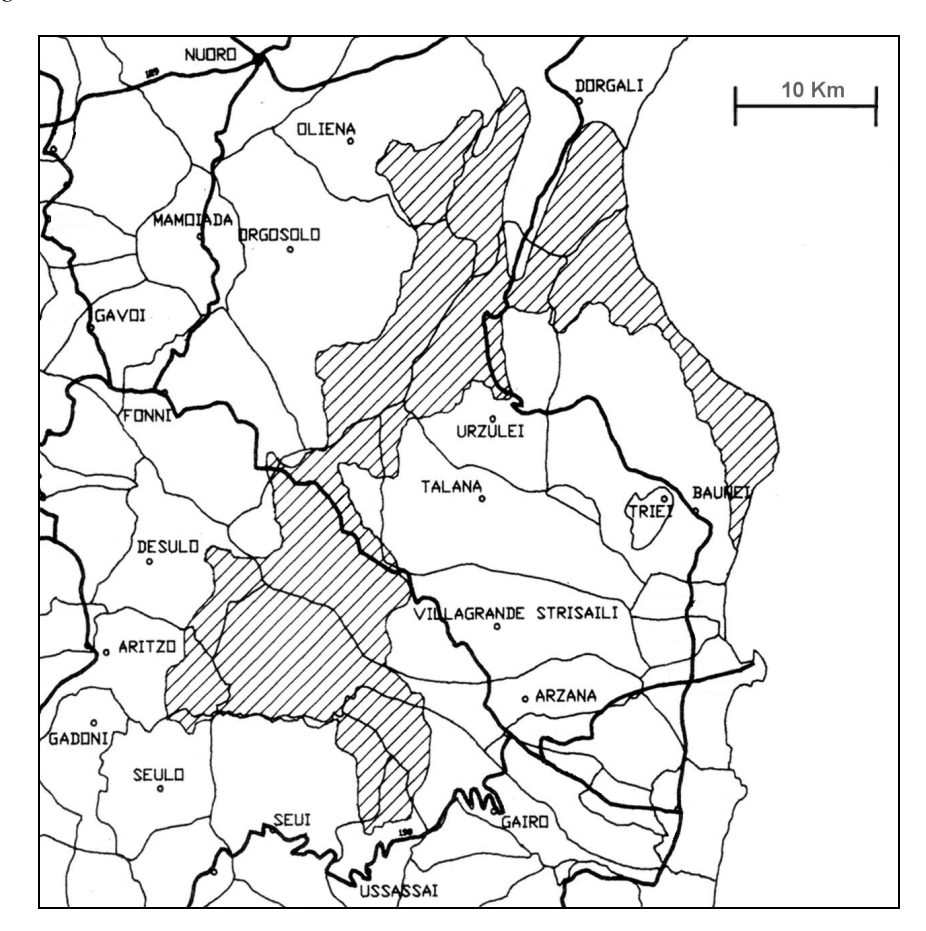
* Protected areas are slashed

In Sardinia, Regional Law No. 7 dated 15.01.2001, makes provisions for training courses for return migrants to facilitate their occupational, social and cultural reintegration (Art. 19). If the returnee intends setting up his/her own business, then he/she enjoys the same rights as residents and the same benefits provided for by the law. In addition, priority processing is given to applicants with returnee status and they are also gi-